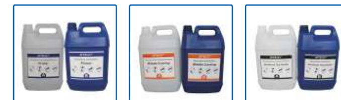
MTB-3327 Epoxy Primer MTB-3328 Epoxy Middle Coat MTB-3329 Epoxy Top Coat